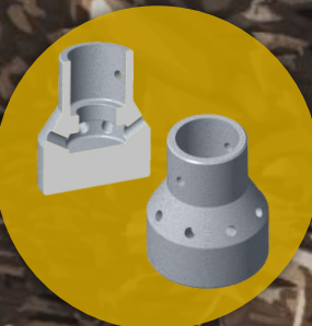
Bubbling Fluidizer Bed Air Injectors